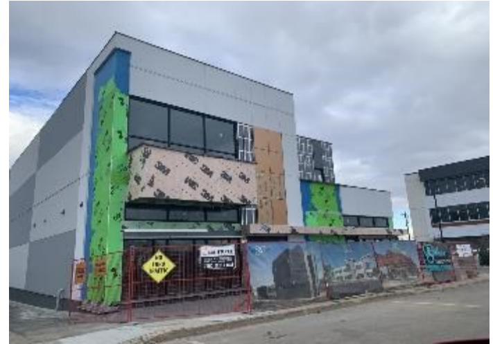
Metro Horizon Corp Project