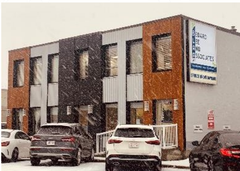
Bedard Lee & Associates LLP