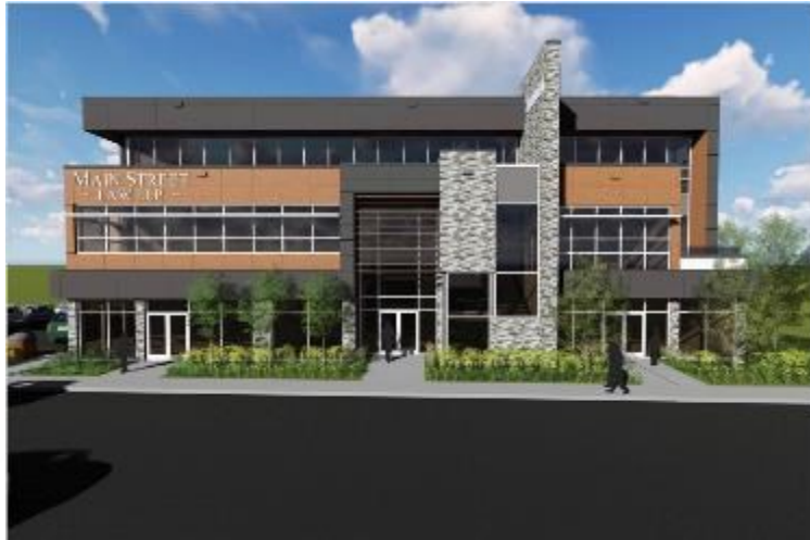
Main Street Law LLP