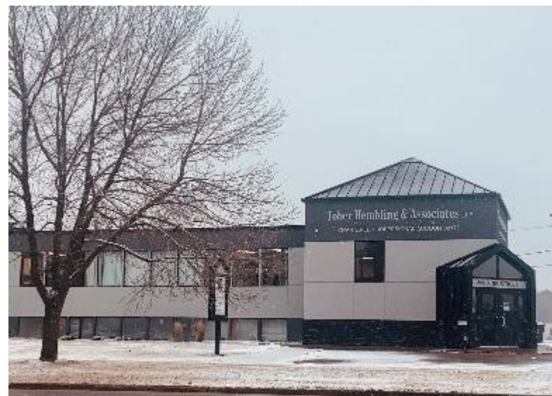
Tober Hembling & Associates LLP