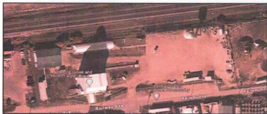
2 GOOGLE IMAGE A1.0 SCALE: NTS