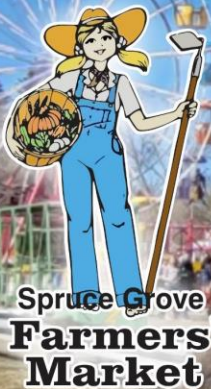
Spruce Grove Farmers' Market